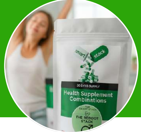
Focus and Mind Stacks

With over 2 million different supplement combinations, we have done the research and created the ultimate SmartStacks for you.