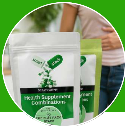
Gut and Digestion Stacks