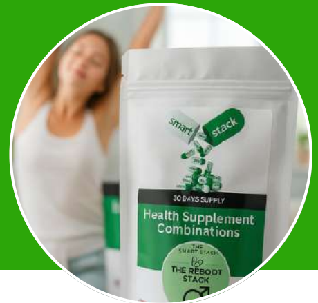
Focus and Mind Stacks

With over 2 million different supplement combinations, we have done the research and created the ultimate SmartStacks for you.